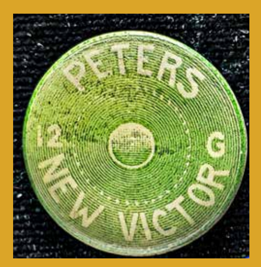
Final rare pin that completed Keith's Peters collection, 1896