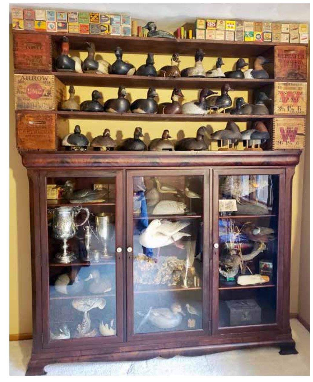
Decoy, ammo & shell box, trophy display

Keith also has a website (UniqueSportingCollectibles.com) dedicated to preserving the history