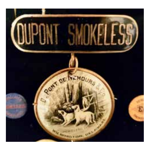
Dupont promotional medal

Keith's collection today consists of over 750 pinbacks, fobs and