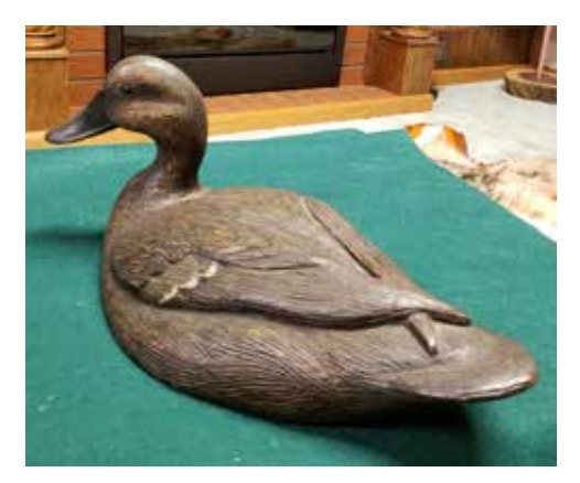
Bud Tully Black Duck, Peterborough, Ont., ca. 1940s