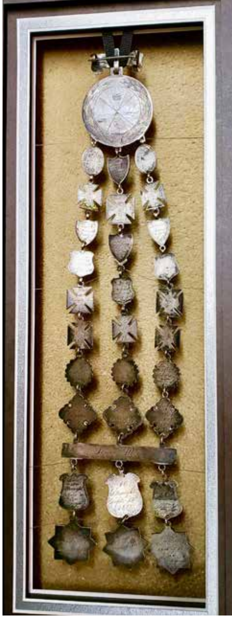
FrontBackKansas City Fishing & Hunting Club perpetual medal, 1873

Finding pieces for his collection has been a challenge since there are relatively few known collectors of these items. In addition to scouring antique malls, he has established a small network of pickers on the east and west coasts where the lion's