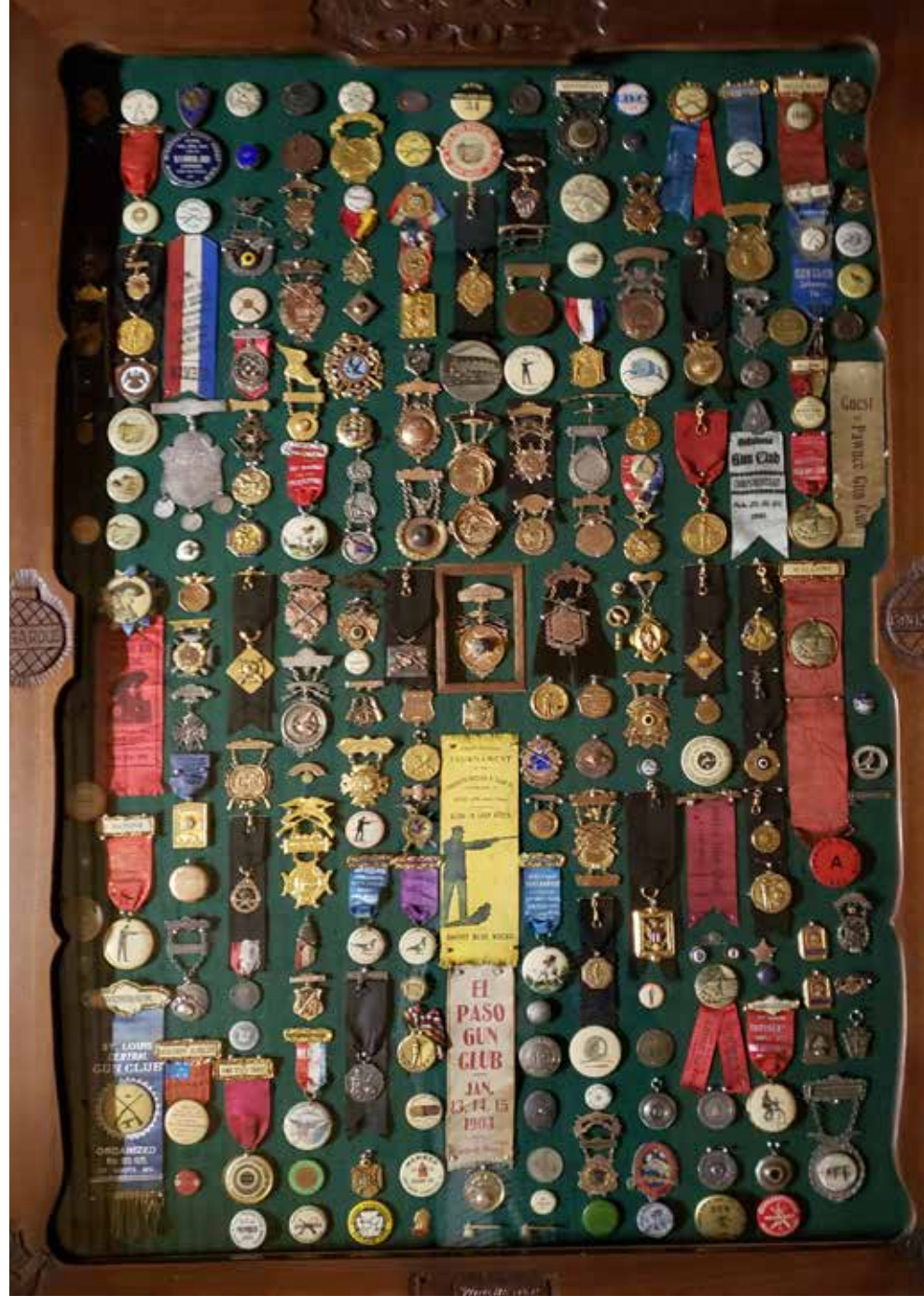
Gun club medal display

1866. However, their use declined precipitously with the introduction of clay targets in 1880.