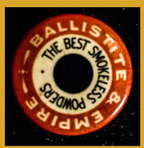
Ballistite pin, ca. 1900