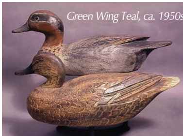
Green Wing Teal, ca. 1950s