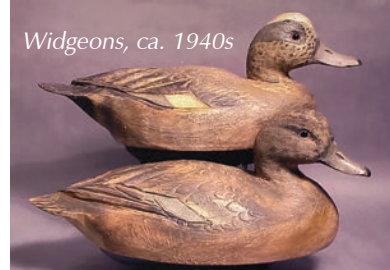
Widgeons, ca. 1940s