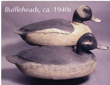
Buffleheads, ca. 1940s