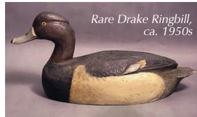
Rare Drake Ringbill, ca. 1950s