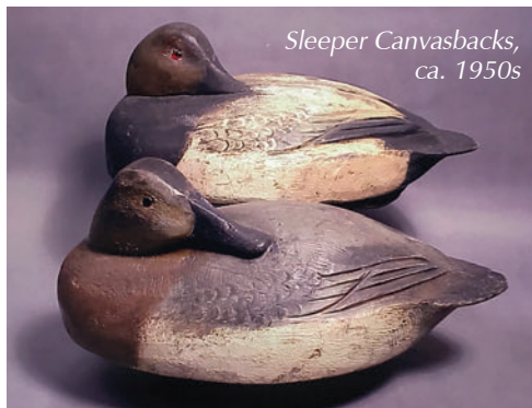
Sleeper Canvasbacks, ca. 1950s