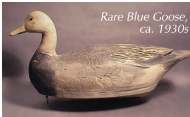
Rare Blue Goose, ca. 1930s