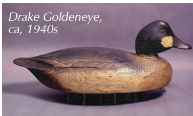
Drake Goldeneye, ca, 1940s