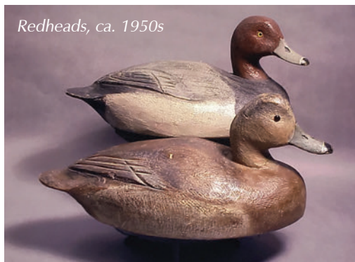
Redheads, ca. 1950s