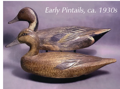
Early Pintails, ca. 1930s