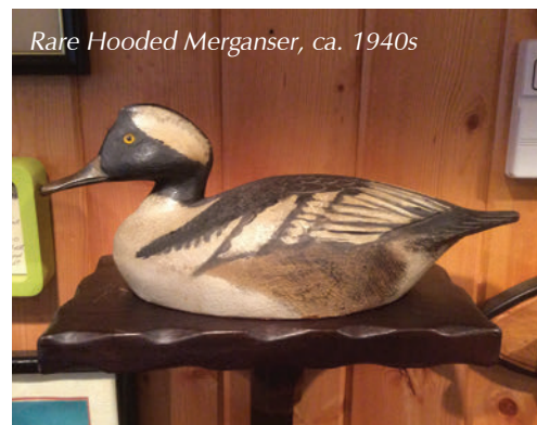
Rare Hooded Merganser, ca. 1940s