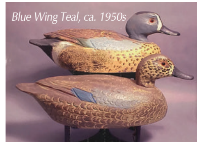
Blue Wing Teal, ca. 1950s