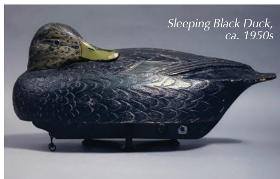
Sleeping Black Duck, ca. 1950s