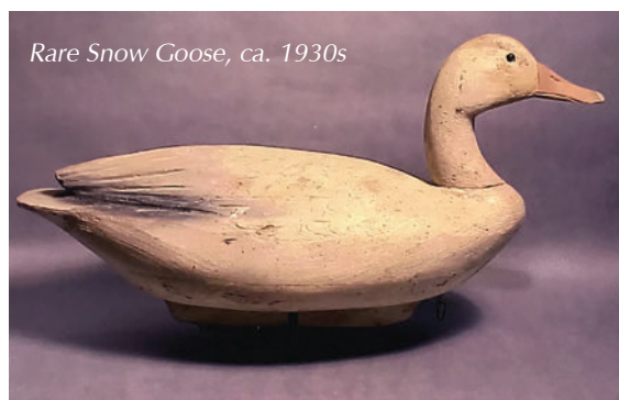
Rare Snow Goose, ca. 1930s